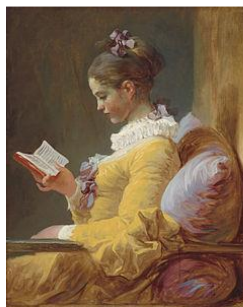
Jean-Honoré Fragonard. (1776). A Young Girl Reading.

Mary Oliver. “The Summer Day” from New and Selected Poems , 1992, Beacon Press, Boston, MA